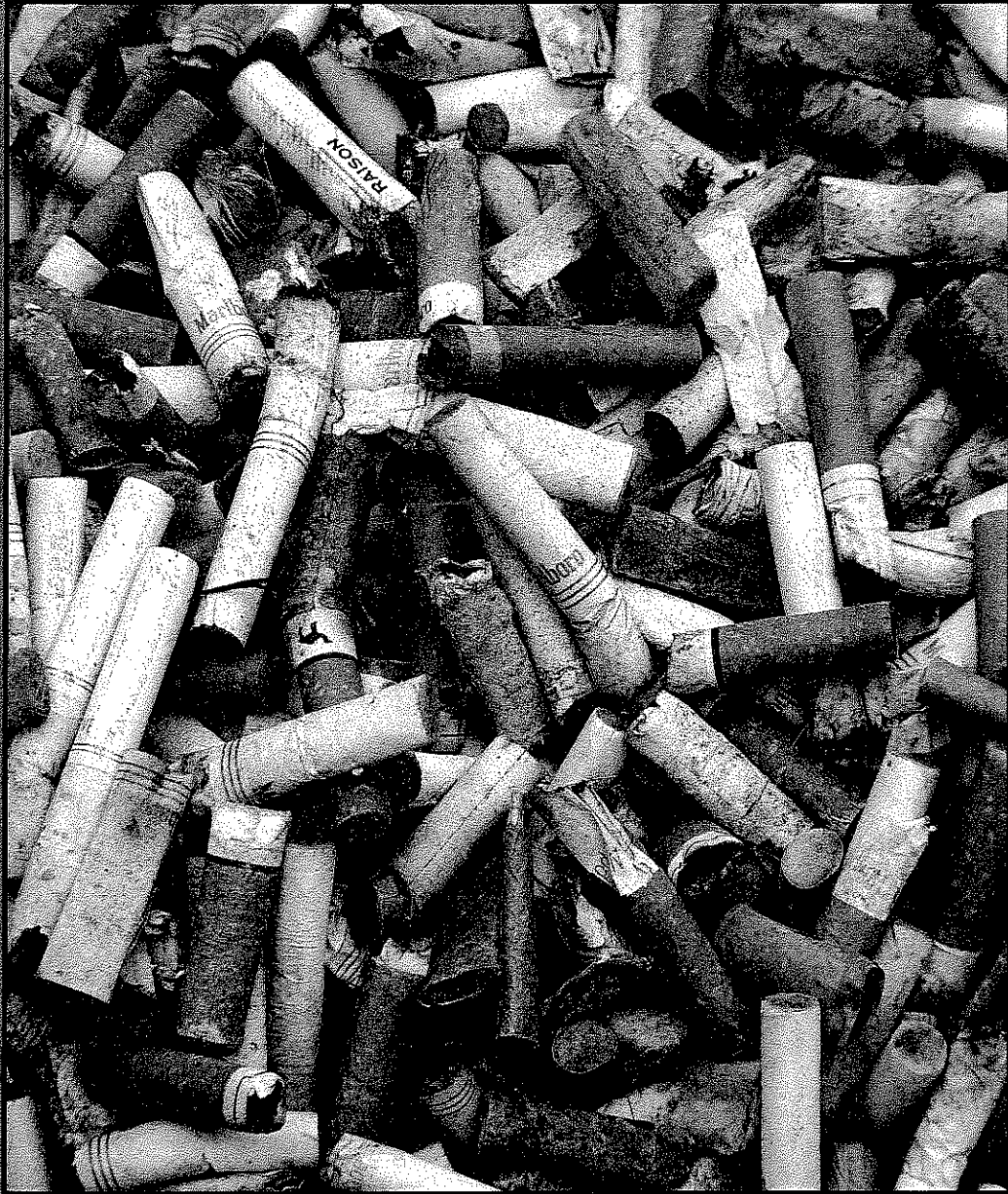
The Environmental Burden of Cigarette Butts