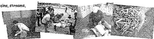
Figure 1 Poster with cigarette butt clean-up results created for Earth Day, San Diego State University, San Diego, California, USA, 2010.